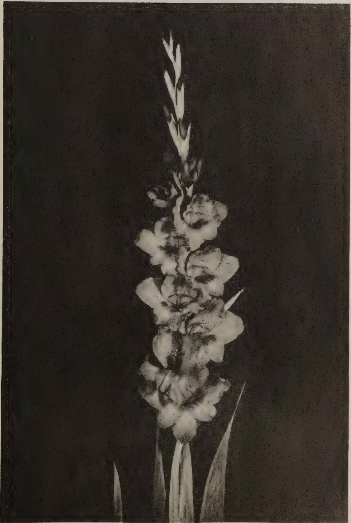
Red Charm from no. 4 size bulb